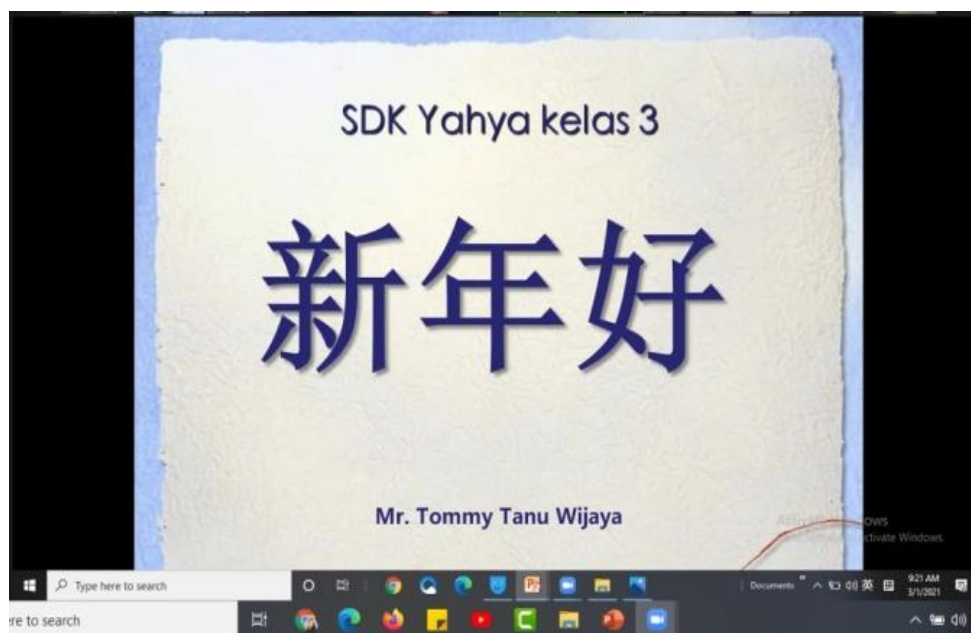
Figure 2. The visiting lecturer was opening the class

students new experience and new learning atmosphere.